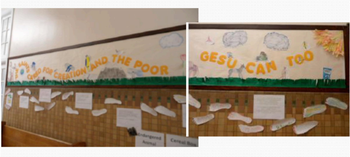
Figure 1. “The Saints cared for creation and the poor – Gesu can too!” Students made a bulletin board to share their knowledge about reducing their carbon footprints with their parents and the school. Each student wrote about human impacts on the environment and steps that they could take to reduce their carbon footprints.